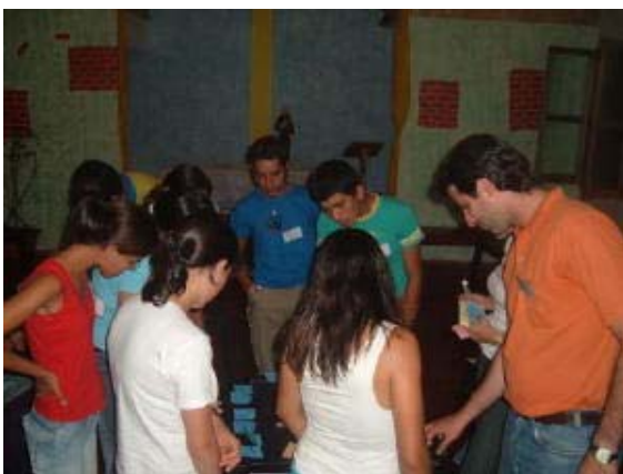
Fig. 1.1—Gender and Youth Training

M.A.T.E. efforts are divided between a gender and youth component in the poorest neighbourhoods of Puerto Iguazú along with an Mbya-Guaraní indigenous component in a community just outside town. The gender and youth training is geared towards employment in hotels and other conventional tourist establishments. The indigenous component is directed towards creating a self-sufficient indigenous tourism training centre where Mbya-Guaraní peoples from across Misiones province can come and receive training about their own culture and the tourism industry.