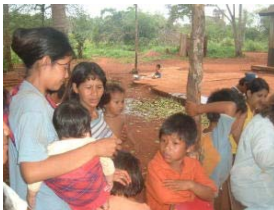
Fig. 1.2—The Yryapu Indigenous Community