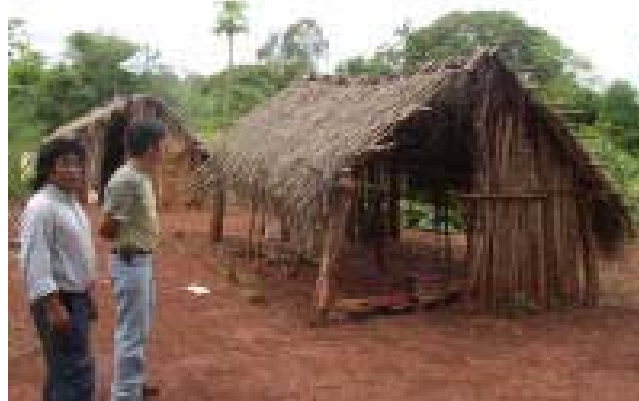
Fig. 1.5—Another view of the proposed construction site