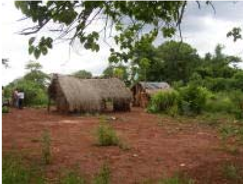
Fig. 1.4—Proposed location for the tourism training centre

The hope of the residents of Yryapu is that the new training centre will nurture new conceptions of indigenous cultural tourism. The small, 60 square-metre space will be a place where dozens of guaraní students from Misiones will learn about their own customs and traditions, not only conserve them but to also create new alternatives in tourism that will benefit the socio-economic development of the Mbya-Guaraní community.